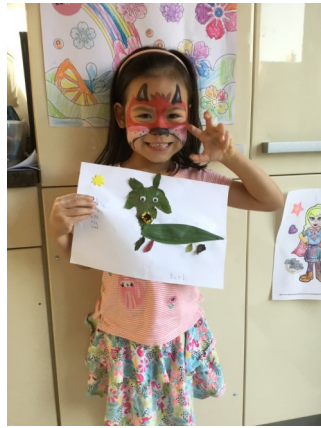
Beth's (Otters) nature picture of a fox made out of leaves and sticks.