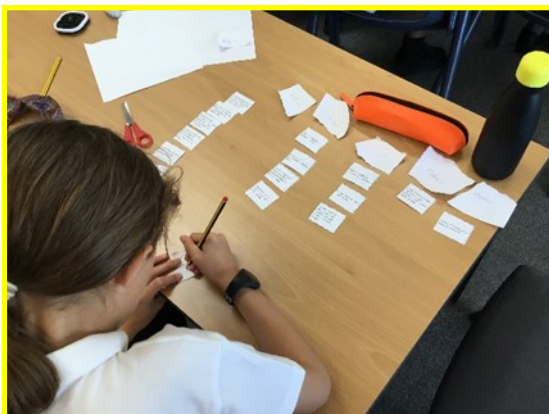
Organising types of racism and discussing how we