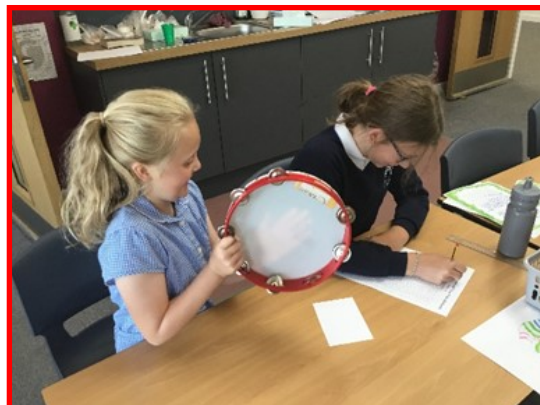
Sensory overload – playing instruments whilst